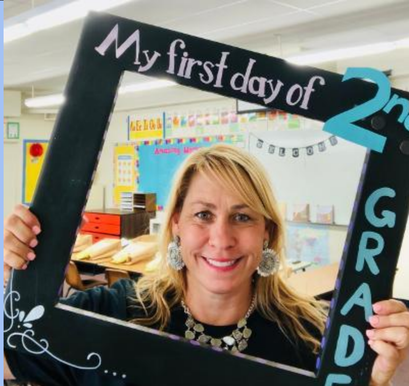
Our Classroom !!!